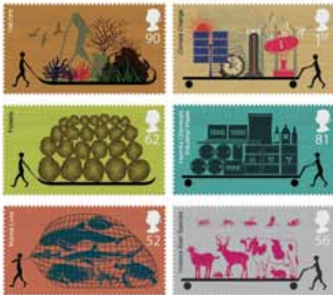
RSA Postage Stamps designed by student

Students are continuously assessed by projects they complete throughout the programme.