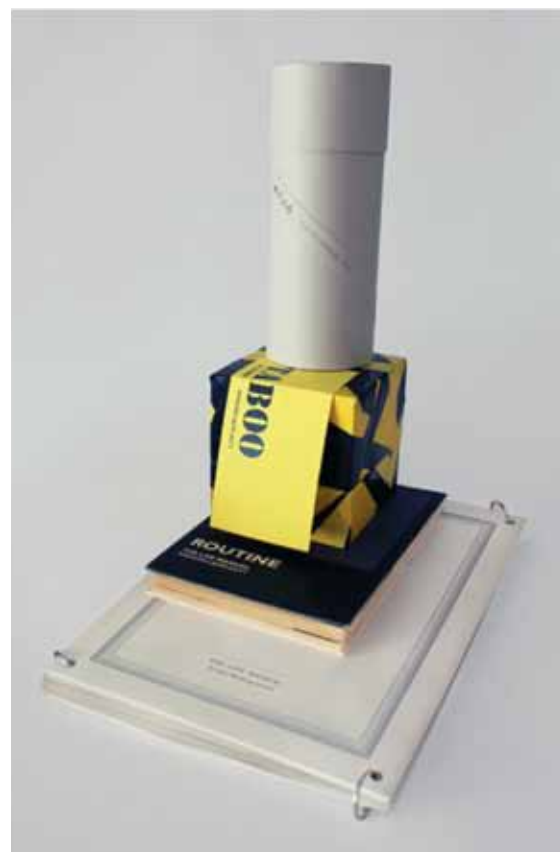
Major Project by student

* More students' works can be viewed at: http://hkuspacedesign.wordpress.com