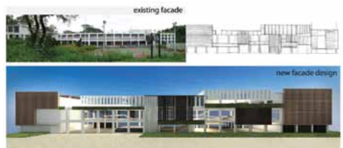
Design project by student (above and below)

In the 2012/13 academic year, two scholarships will be given to new students with outstanding achievements in their Higher Diploma/ Associate Degree studies for enrolling in BA (Hons) Graphic Design and BA (Hons) Interior Architecture and Design. The amount of each scholarship is HK$6,000.