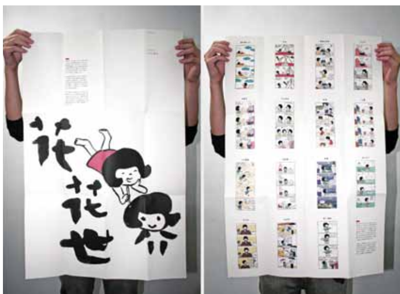
Free Paper designed by student

密德薩斯大學以創新的課程著稱，於倫敦的芸芸大學中，密德薩斯大學的研究水平更名列前茅，其設計課程無論在設計業或學術界均得到極高的評價和肯定，學生們更於國際性設計比賽中屢獲殊榮，過去數年間，已贏取超過二十五個設計獎項。