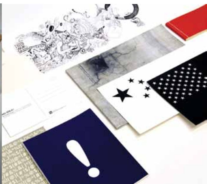
Company Brochure designed by student